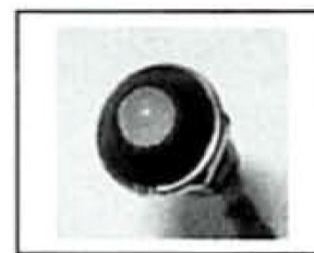
Remote Annunciate Light (RAL)